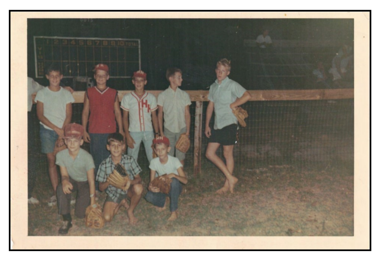
Boys Soft Ball team at HHRC, Unidentified and year unknown