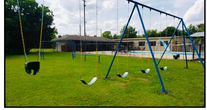
HHRC, 2020s