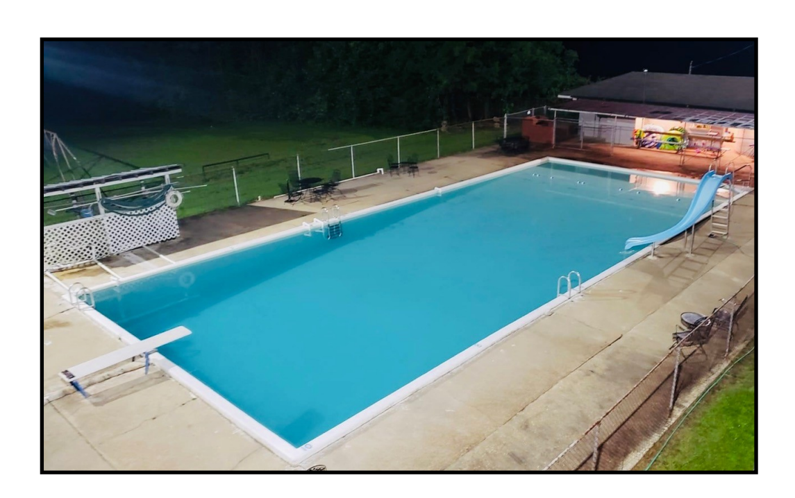
HHRC Pool, 2020s

HHRC Membership Dues Notice, 1987