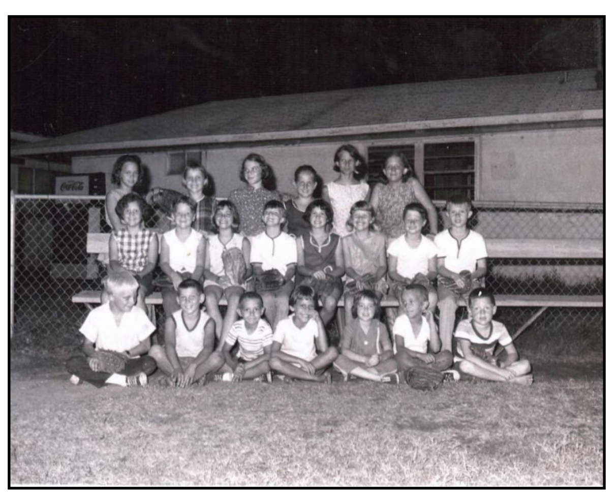
Group of Hope Hull youth who participated in HHRC activities, year unknown Courtesy Chelle Malone Kenmore